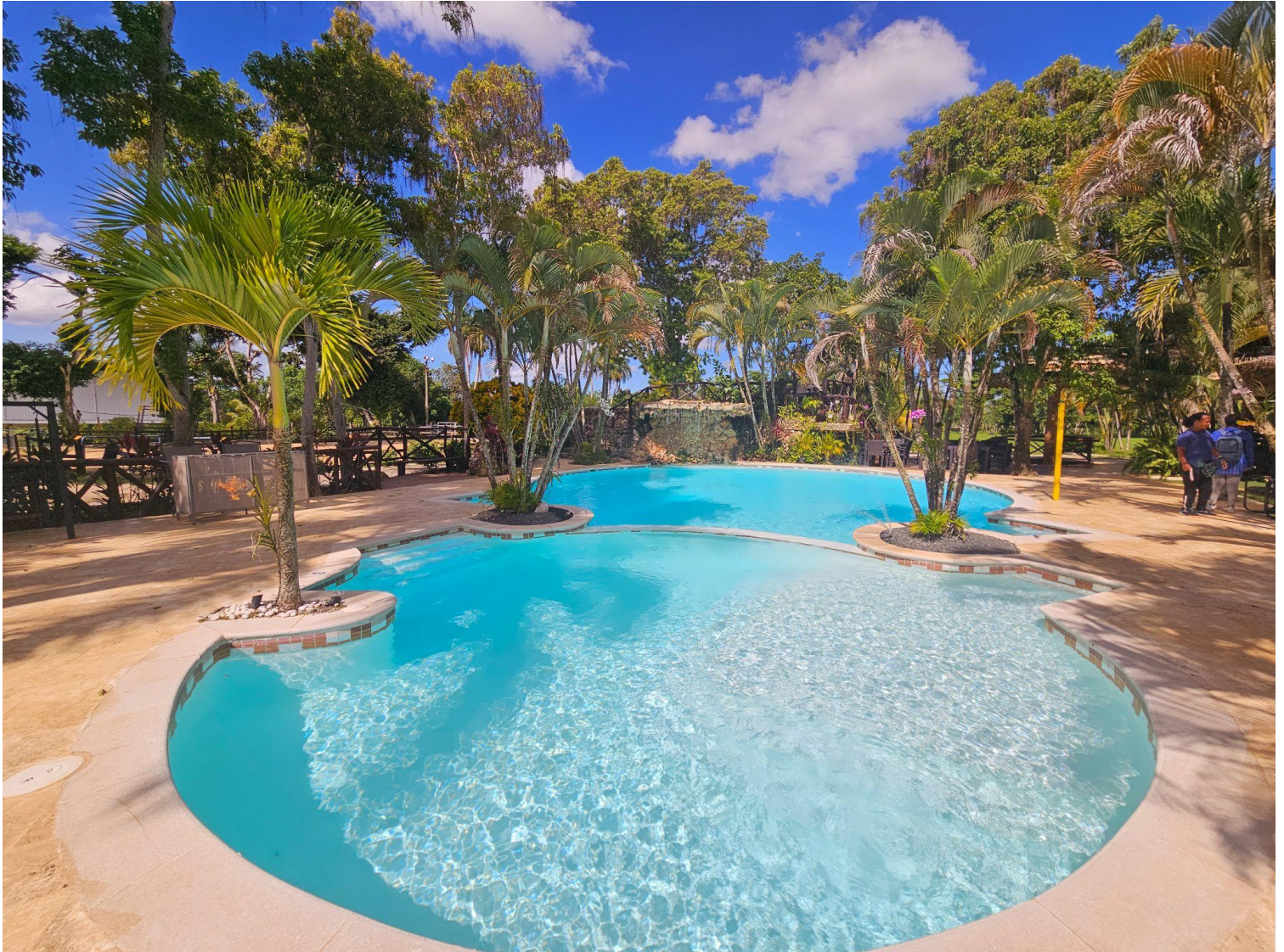
One of the impressive pools at Rancho Don Rey, where students spend two nights on their excursion.

We encourage you to enroll on your 1st choice program as early as you can! In fact, our most popular programs fill early every year, and many students end up putting off the quick and easy application process only to end up on the waiting list. The best way to ensure that you save your spot is to place your deposit and apply early. You can easily enroll online at www.experiencegla.com/enroll .